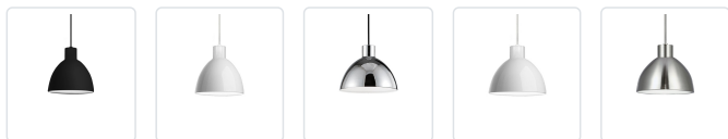
PD1706-BK Black PD1706-WG Glossy White PD1706-CH Chrome PD1706-WH White PD1706-BN Brushed Nickel